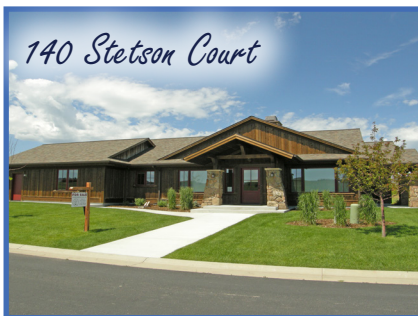
140 Stetson Court