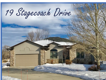
19 Stagecoach Drive