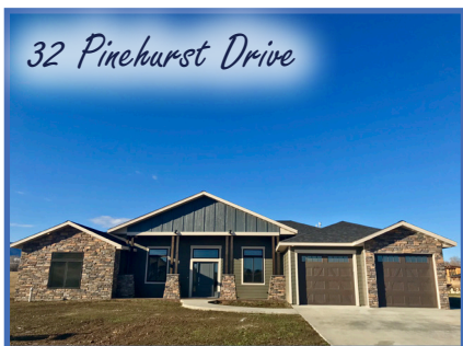
32 Pinehurst Drive