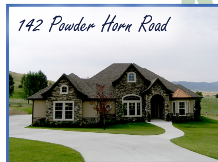
142 Powder Horn Road