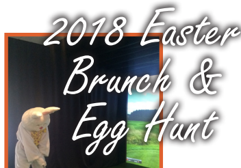
2018 Easter Brunch & Egg Hunt