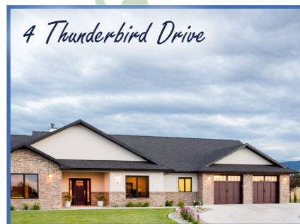
4 Thunderbird Drive