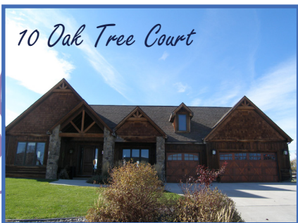
10 Oak Tree Court