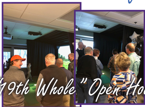
"19th Whole" Open House