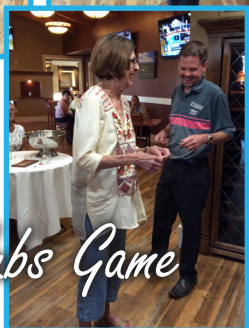
Ace of Clubs Game