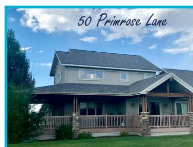
50 Primrose Lane