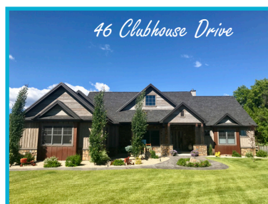
46 Clubhouse Drive