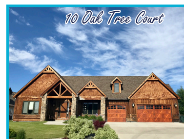
10 Oak Tree Court