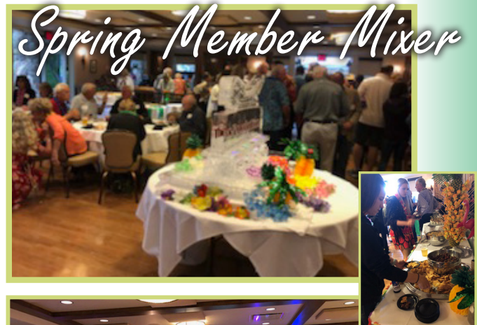
Spring Member Mixer