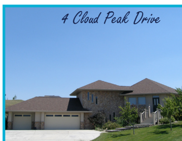
4 Cloud Peak Drive